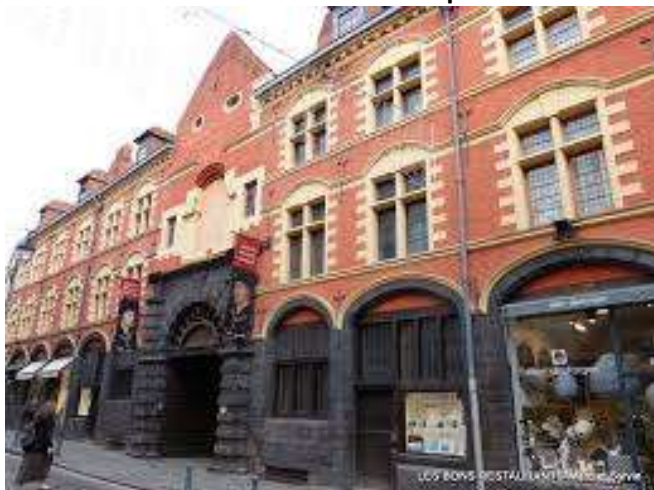
Rue de la monnaie entrée Hospice Comtesse