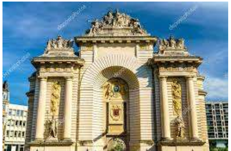
porte de Paris ou porte Louis XIV