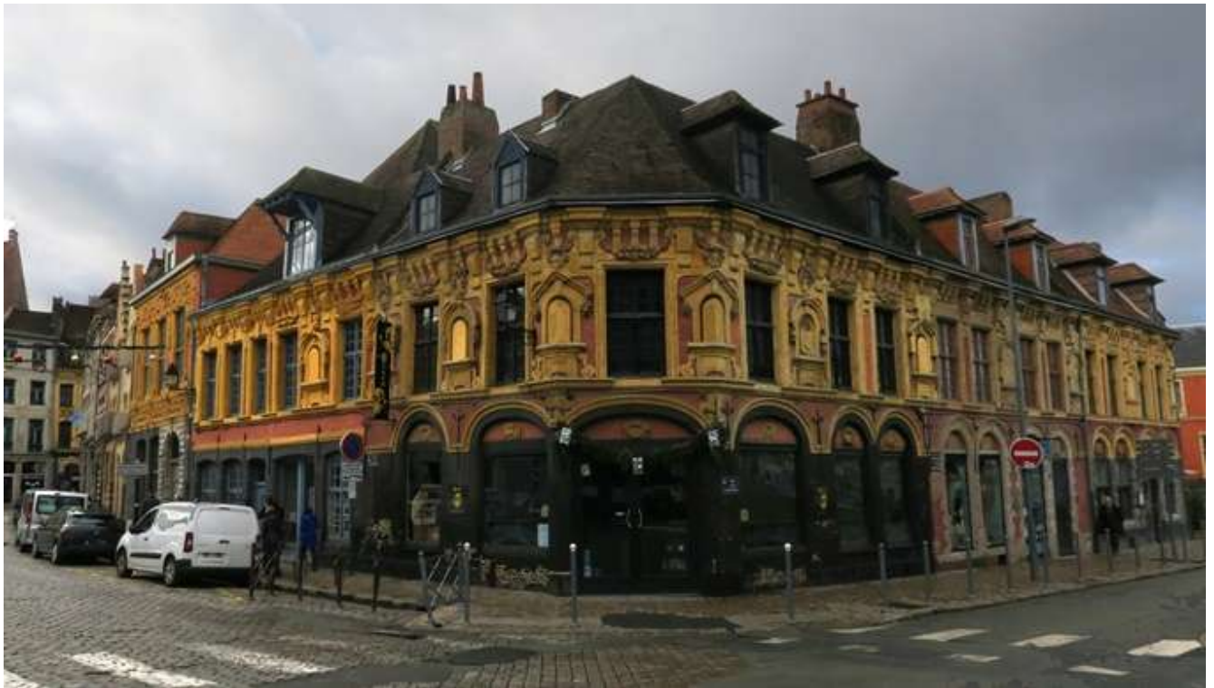
Place Louise de Bettignies