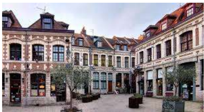
district in old Lille

Dinner show at Chapitô The new Lilloise scene Night at the hotel