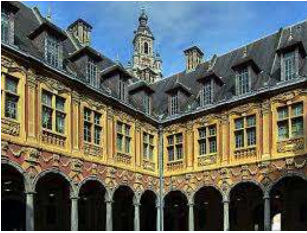
Cour intérieure de la vieille bourse