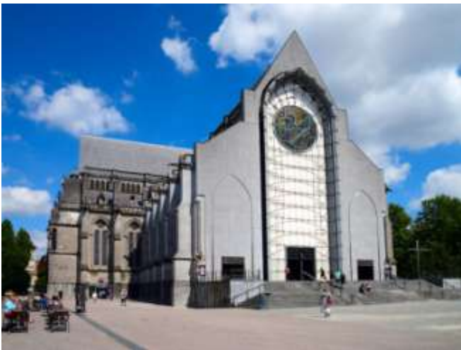
Cathédrale de la Treille et sa porte d'albâtre

Afternoon, visit on foot of the Old Lille, the old stock market, the big place, the door of Ghent, the cathedral of the Treille,