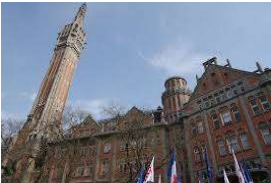
Lille town hall and its belfry