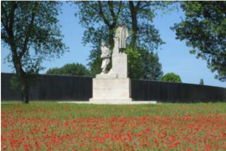
"The poppies symbol of rest, tranquility and consolation"

Under a decree of March 20, 2014 issued by the Minister of Defense and the Minister Delegate for Veterans Affairs, the national cemetery of Notre-Dame de Lorette has become a "Mecca of the national memory of the Ministry of Defense. defense ", in that it is linked to the memory of contemporary conflicts since 1870, that it has a national and emblematic character of an aspect of contemporary conflicts and that it is maintained by the Ministry of Defense or under its responsibility, to perpetuate the memory of contemporary conflicts and to maintain the army-nation link. More specifically, the necropolis is distinguished under the military dead for France alongside their allied arms brothers (1914-1918).