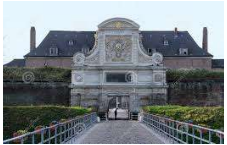
entrée de la Citadelle